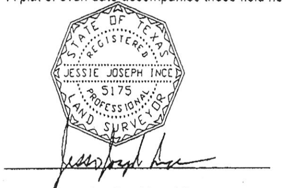
Registered Professional Land Surveyor

A plat of even date accompanies these field notes.