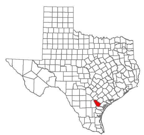
Bee County, Texas

Texas State Plane Zone 4 TX - S Central Projection: Lambert Conformal Conic GCS North American 1983 Datum: D North American 1983