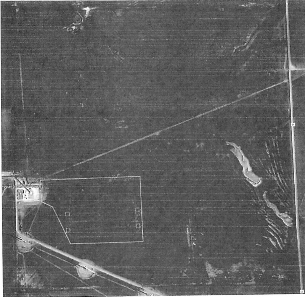
EXHIBIT A (CONTINUED) SITE LOCATION MAPS OF BLOCKSTREAM SERVICES REINVESTMENT ZONE