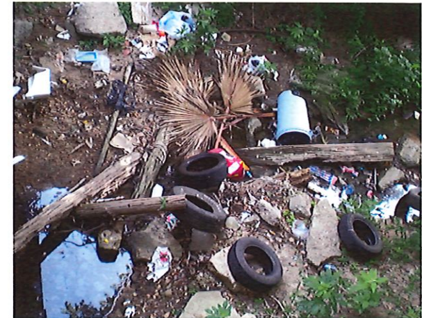
Cedar Creek on Old Navasota Rd.

Taxpayers pay the cost of cleaning up dumps on public lands and right-of-ways.